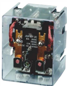
JQX-62F 2Z 80A

80A 2Z Contact Change-over Capacity With Opening and Dust-proof Type